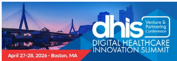
Digital Healthcare Innovation Summit April 27-28, 2026 | Boston, MA