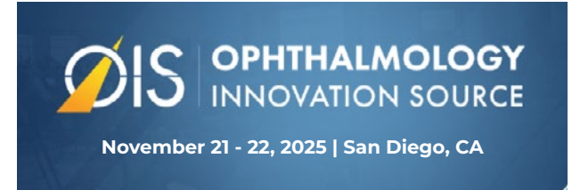
OIS XV (Ophthalmology Innovation Summit) November 21 - 22, 2025 | San Diego, CA