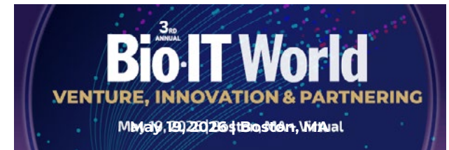
Bio-IT World Venture, Innovation & Partnering May 19, 2026 | Boston, MA