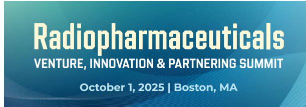
Radiopharmaceuticals Venture, Innovation & Partnering Summit October 1, 2025 | Boston, MA